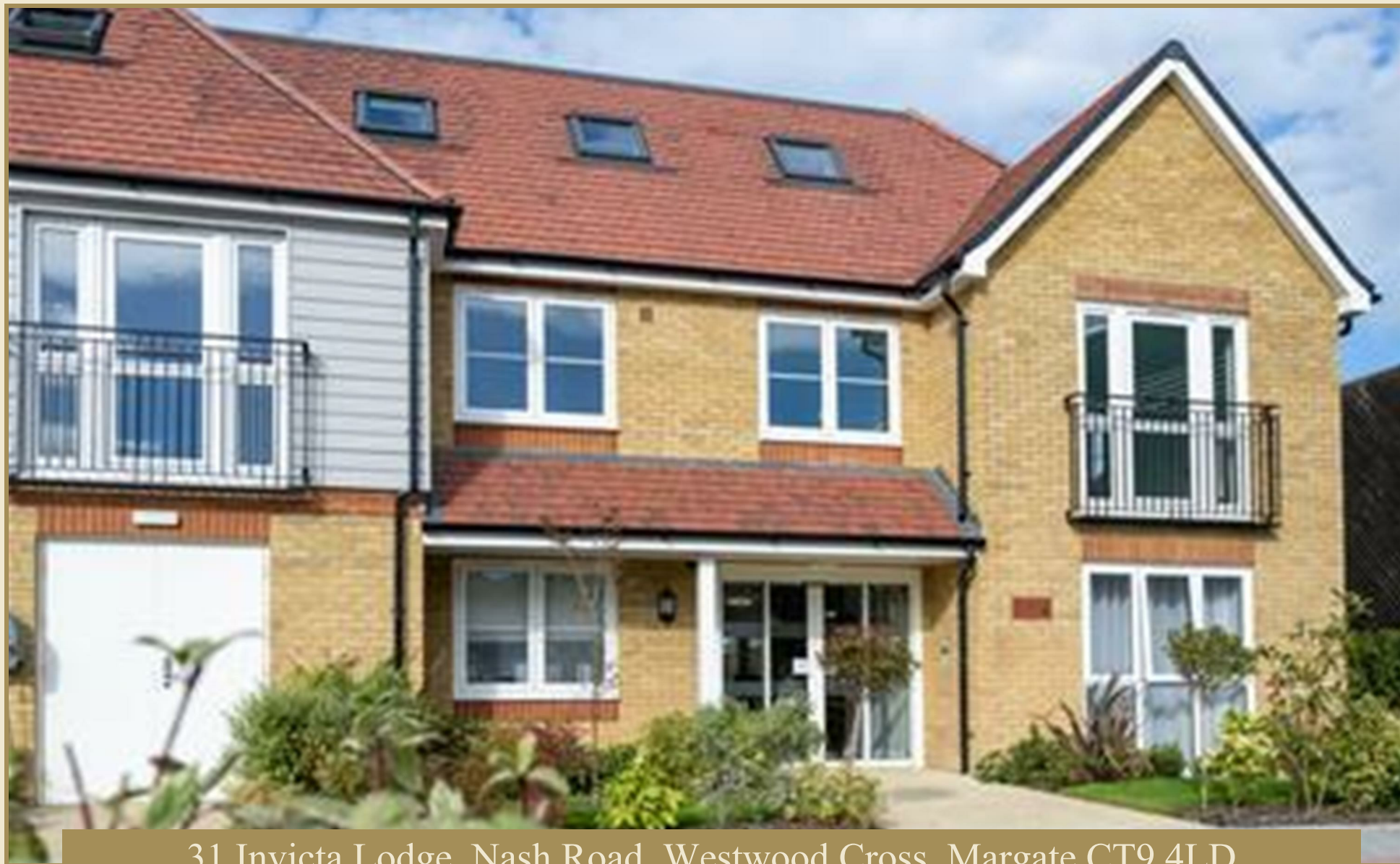
31 Invicta Lodge, Nash Road, Westwood Cross, Margate CT9 4LD